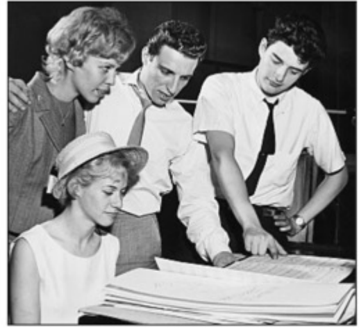
Early 1960s. Carole King at piano, with fellow Brill Building songwriters Barry Mann and Cynthia Weil behind her, and husband/partner, Gerry Goffin, far right.