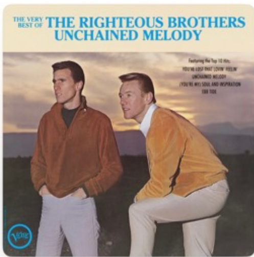
The Righteous Brothers