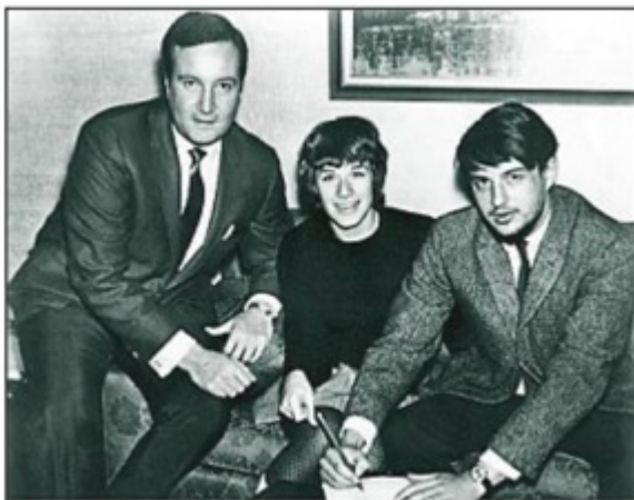
Carole King and Gerry Goffin with Aldon Music owner and creator, Don Kirshner, 1960s.