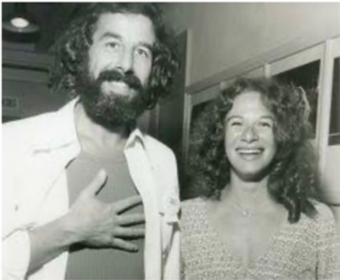
LOU ADLER AND CAROLE KING, 1970.