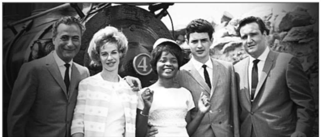
Later 1963 photo for the hit song, "The Loco-Motion," from left: Aldon Music producer Al Nevins; composer, Carole King; singer, Little Eva Boyd; songwriter, Gerry Goffin; and Aldon Music producer, Don Kirshner. Click to visit 'Loco-Motion' story.