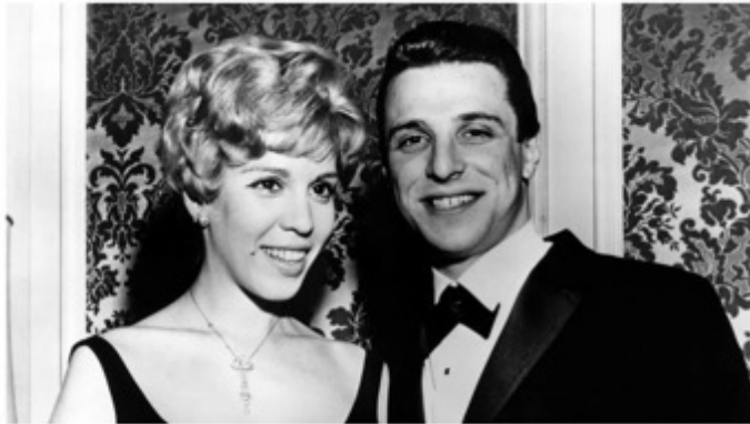
Cynthia Weil and Barry Mann in New York City circa 1965. Together, the songwriting couple has helped sell an estimated 200 million records.