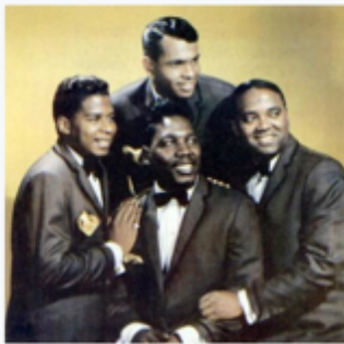
The line up of The Drifters from 1964 clockwise Left to Right: Eugene Pearson, Johnny Terry, Charlie Thomas , and Johnny Moore .