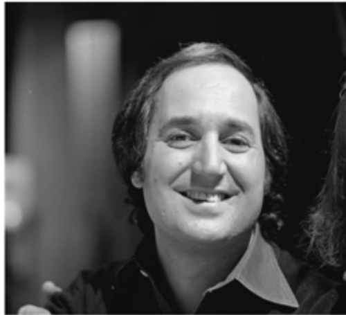
Sedaka on TopPop in 1974