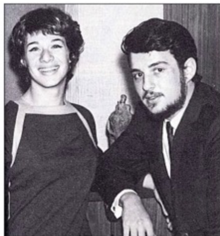
Carole King & Gerry Goffin, somewhat later 1960s.