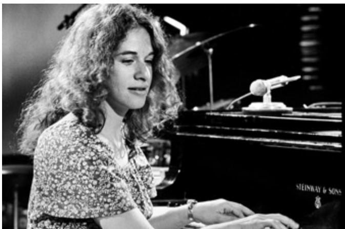
Carole King 1970s