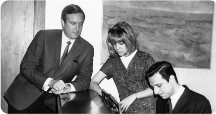
Don Kirshner stands at the piano with Cynthia Weil and Barry Mann in 1962