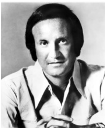
Don Kirshner in 1976.