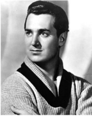
Sedaka in 1965