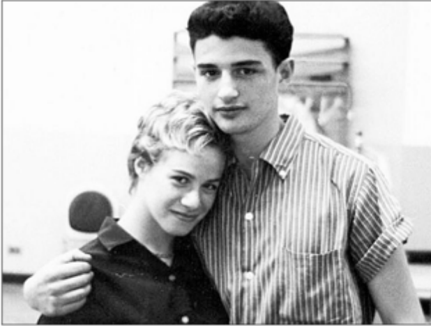
1959: In a photo that suggests an air of youthful confidence, young lovers Carole King & Gerry Goffin are about to hit the big time with a string of pop music hits. But their union would not survive the shoals of 1960s' drugs and entertainment-world temptations.